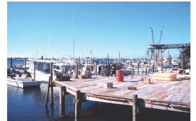
Shrimp, snapper, grouper and stone crab fishing boats.

In some cases IFQ programs have increased product quality by improving fishing and handling methods. They have also