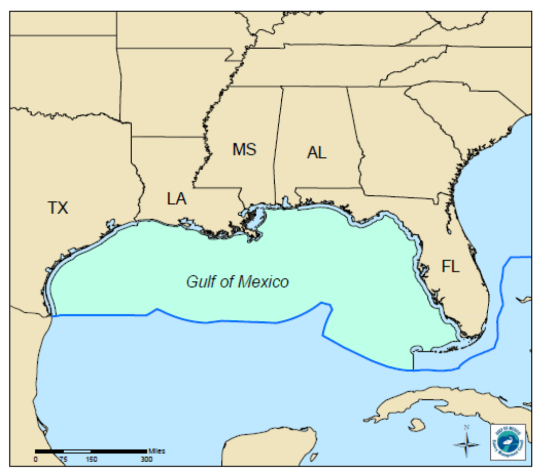
Figure 1.1.1. Jurisdictional boundary of the Gulf of Mexico Fishery Management Council.

Statement. Any events that change the fundamental nature of this proposed action will require a reevaluation of the categorical exclusion to determine its continued validity.