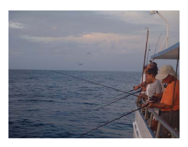
Including, Regulatory Impact Review, and Regulatory Flexibility Act Analysis

Framework Action to the Fishery Management Plans for Reef Fish Resources of the Gulf of Mexico and Coastal Migratory Pelagic Resources of the Gulf of Mexico and South Atlantic Headboat Electronic Reporting Requirements